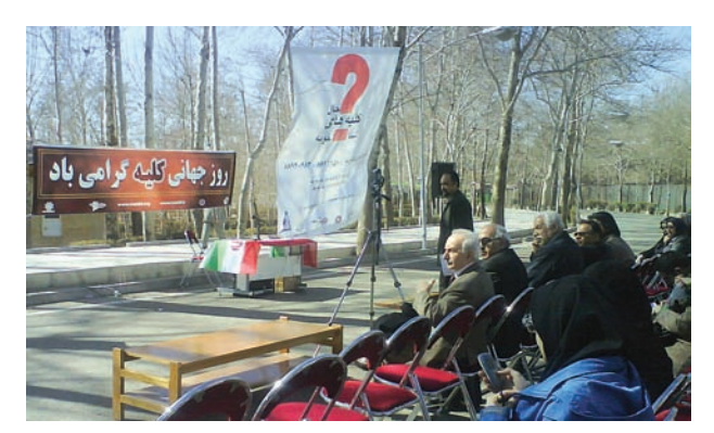
Tree Implantation day and the WKD were two occasions which were the reason to hold a special program.

will be referred to the nephrologists for further evaluations.