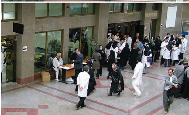
A screening program was held in Shaheed Labbafinejad Medical Center.

and the Urology and Nephrology Research Center of Shahid Beheshti University. High-risk individuals were invited by brochures distributed in the streets near the hospital to participate in the screening program. In March 13, more than 500 people with one of the following criteria presented to the clinic: age greater than 45 years, hypertension, diabetes mellitus, family history of CKD, and history of recurrent urinary tract infections. They passed a few