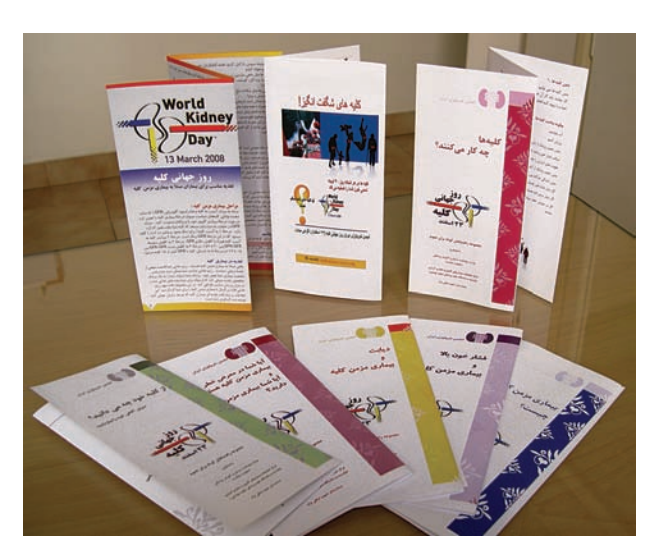
Educational pamphlets for the public were prepared by the Iranian Society of Nephrology and the Urology and Nephrology Research Center. They were distributed in many centers in which special programs for the WKD were held.

Eight educational pamphlets were published for promoting the public knowledge on kidney function, CKD, risk factor of CKD, hypertension and CKD, diabetes mellitus and CKD, nutrition of patients with CKD, etc. The contents were prepared and revised by a large group of experts and examined