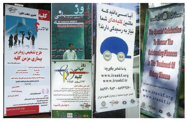
Posters and banners held in Tehran by several organizations.

Across the city, several posters and billboards were erected to introduce the WKD and encourage people to understand the importance of their kidneys. These illustrative materials constituted the WKD international logo and the Persian slogan of the WKD, "Amazing Kidneys!" The Iranian Society of Nephrology, the Foundation for Special Diseases, and the Association of Kidney Disease Patients'