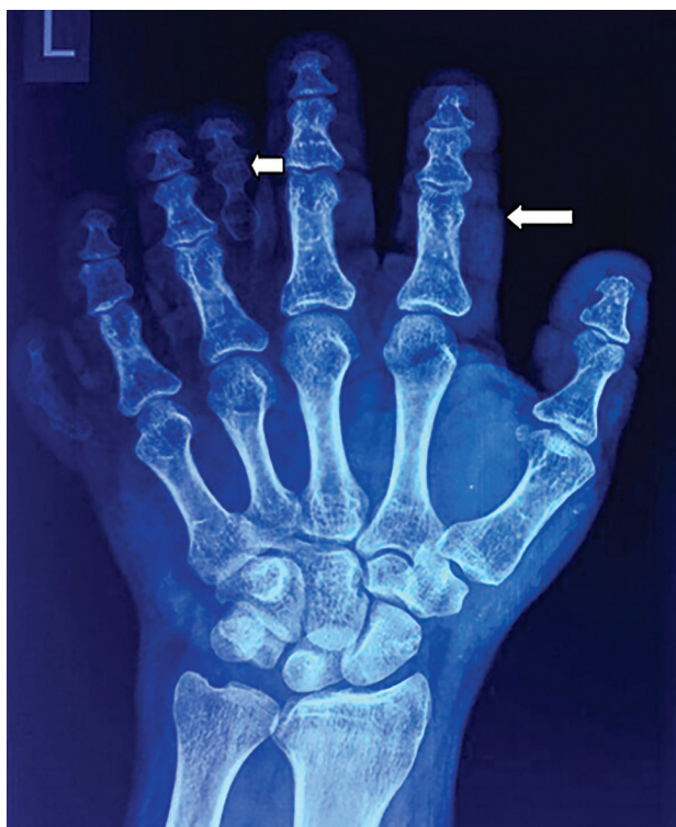
Figure 1. It shows polydactyly, brachydactyly, and syndactyly in the left of the patient (arrows).