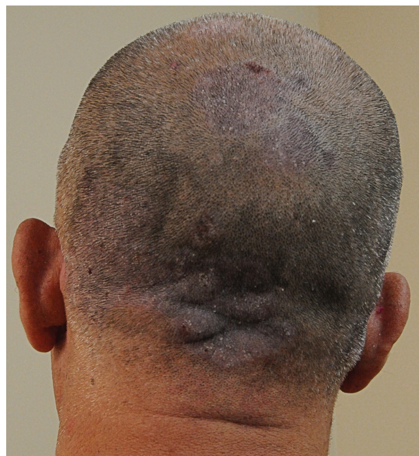
Figure 1. Newly originated itchy squamous plaques on the hairy part of the scalp skin.

the patient started to complain of skin dryness and newly originated itchy, squamous plaques on his hairy part of the scalp skin (Figure 1), on his back, and in external ear canal. The exit site of PD catheter was involved by Koebner phenomenon due to persistent traumatization (Figure 2).