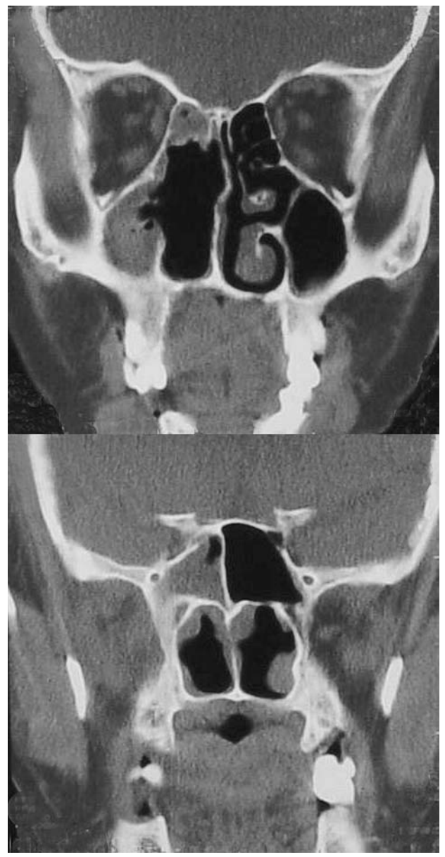
Figure 1. Coronary computed tomography scan with opacification of the left-sided sinuses (maxillary, ethmoidal, and sphenoidal).

Radiography of the paranasal sinuses revealed opacification of the left ethmoidal and maxillary sinuses. Therefore, the patient was treated with ceftriaxone and metronidazole. On day 6, he had worsening of his headache and left facial and orbital pain. Brain computed tomography (CT), electroencephalography, and neurological and ophthalmologic examination did not show any abnormality. On day 10, the patient became febrile (temperature, 38°C) and cytomegalovirus antigen became positive. Ganciclovir, 250 mg/d, was started on and cyclosporine and