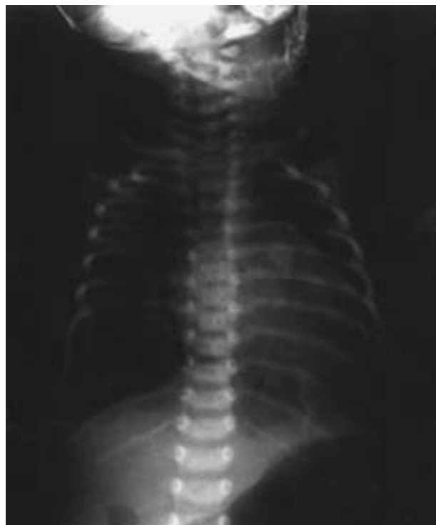
Figure 1. Cardiomegaly was visualized on chest radiography.

and empirical antibiotic therapy consisting of ampicillin, 100 mg/kg, plus ceftriaxone, 100 mg/kg, was started. Chest radiography showed cardiomegaly (Figure 1). Cardiologic consultation and echocardiography revealed a small atrial